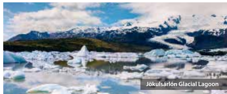
Jökulsárlón Glacial Lagoon