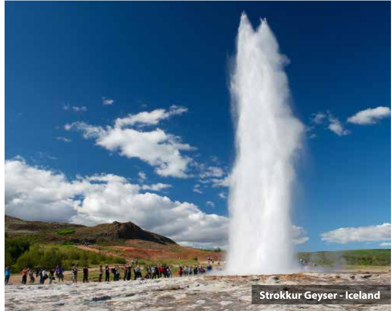
Strokkur Geyser - Iceland

Today we will be immersed in the rugged beauty of Iceland as we travel around the famous Golden Circle. We'll begin at Thingvellir National Park, where the North American and Eurasian tectonic plates meet. Icelanders gathered here in AD 930 and established one of the world's first parliaments. We'll continue on and experience the breathtaking force of Iceland's geysers as we visit Geysir and Strokkur. Afterwards, we'll be inspired by the power and beauty of Gullfoss Waterfall. Tonight, we'll relax in the quaint town of Fludir. Meals: B, D