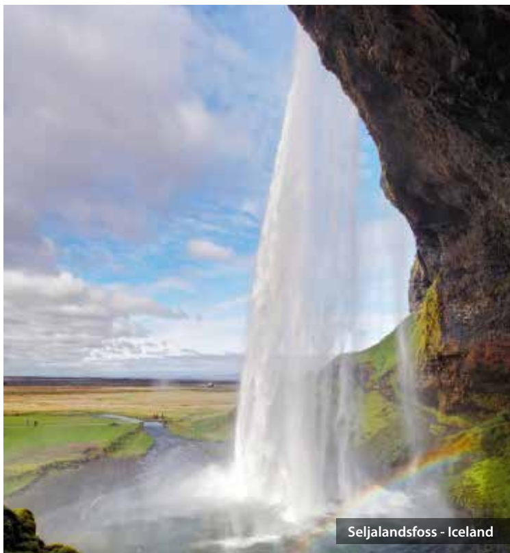
Seljalandsfoss - Iceland

Today we’ll have the opportunity to relax and explore Reykjavik. This city has many wonderful museums, shops, restaurants, and attractions. Perhaps explore the waterfront, shop along the busy street of Laugavegur, or visit the National Museum of Iceland. Tonight, we’ll rejoin the group for a final dinner where we can reminisce about the amazing experiences we’ve had. Meals: B, D