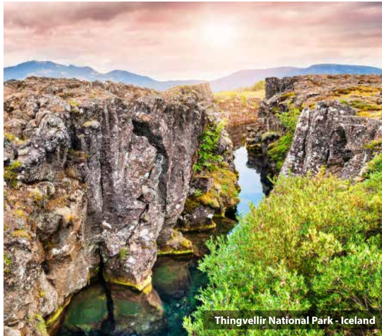
Thingvellir National Park - Iceland

After a morning arrival in Iceland, we will board a deluxe motorcoach and begin our journey. One of our first stops will be the Viking World Museum. Here, we will learn about Iceland's fascinating history and view the replica of a Viking ship. Afterwards, we'll enjoy a tour of Reykjavik, the largest city and capital of Iceland. Settled by the Norseman in the 9th century, Reykjavik has been molded through the centuries by various economic, political, and artistic influences. It stands as a fascinating example of human survival and ingenuity amidst inhospitable and unpredictable surroundings. This evening we will gather for dinner and look forward to experiencing the wonders of Iceland. Meals: D