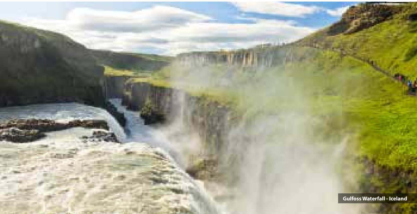
Gulfoss Waterfall - Iceland